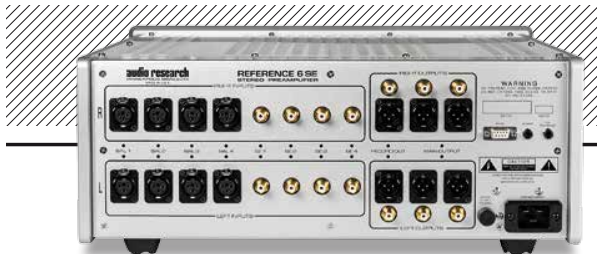
ABOVE: A full eight separate line inputs are offered (four balanced on XLRs and four single-ended on RCAs) with duplicate XLR/RCA record outputs and two sets of XLR/RCA preamp outputs. The latter are variable or fixed in 'processor' mode

mean it fetishises small production effects in a recording – it reveals these very well too, by the way – but rather it tells you all about the timbral qualities of the instruments and vocals that it's reproducing. The result is a really authentic and tangible sound, and one that's impossible not to like.